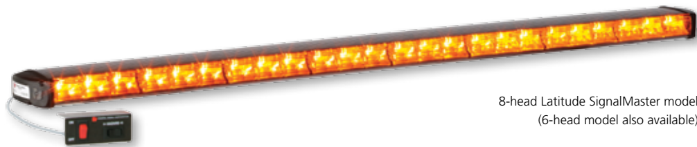
8-head Latitude SignalMaster model (6-head model also available)